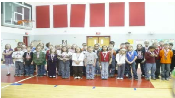
Fourth Grade Medal Winners!!