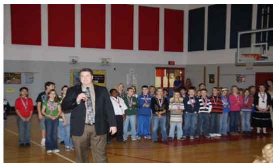
Fifth Grade Medal Winners!!